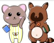
HULS Official Characters Kumaji & Ponta

For another "student selected book" display created by HULS, we have 「Gacha books ~an encounter with a new book lottery~」 It is currently under planning at West Library. Please look forward to more information!