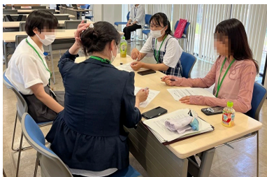
Group Work Session