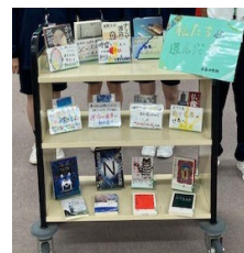
Saijo Junior High (until 10/11)

In September, we conducted workplace experience programs for Saijo Junior High School and Koyo Junior High School students. The books they selected are on display at the Nishi Library. Please come and take a look!