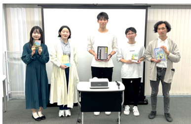
Block Preliminaries, 2023