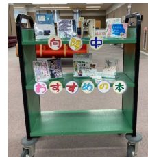
Koyo Junior High (until 10/18)