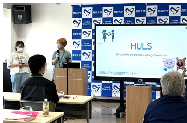
Activity Report Session

On September 5-6, two members of HULS (Hiroshima University Library Supporters) participated in the 12th University Library Student Collaboration Exchange Symposium held at Tottori University. Through activity reports, group work, and free talk sessions, they interacted with students active in university libraries across the country.