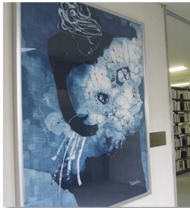
▲ Hideko Amemura "Flower Offering (Psalm 37-24)"