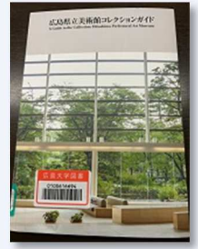
Hiroshima Prefectural Art Museum Collection Guide (Central Stacks) 092.7/H73