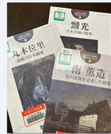
Mini Guide to the Collection of the Hiroshima Prefectural Art Museum (Central Stacks) 092.7/H73

Here are some recommended books for those who want to learn more about the art scene in Hiroshima.