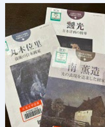
Mini Guide to the Collection of the Hiroshima Prefectural Art Museum (Central Stacks) 092.7/H73

Here are some recommended books for those who want to learn more about the art scene in Hiroshima.