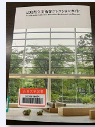
Hiroshima Prefectural Art Museum Collection Guide (Central Stacks) 092.7/H73