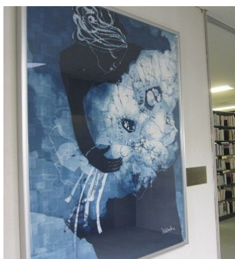
▲ Hideko Amemura "Flower offering" (Psalm 37-24)